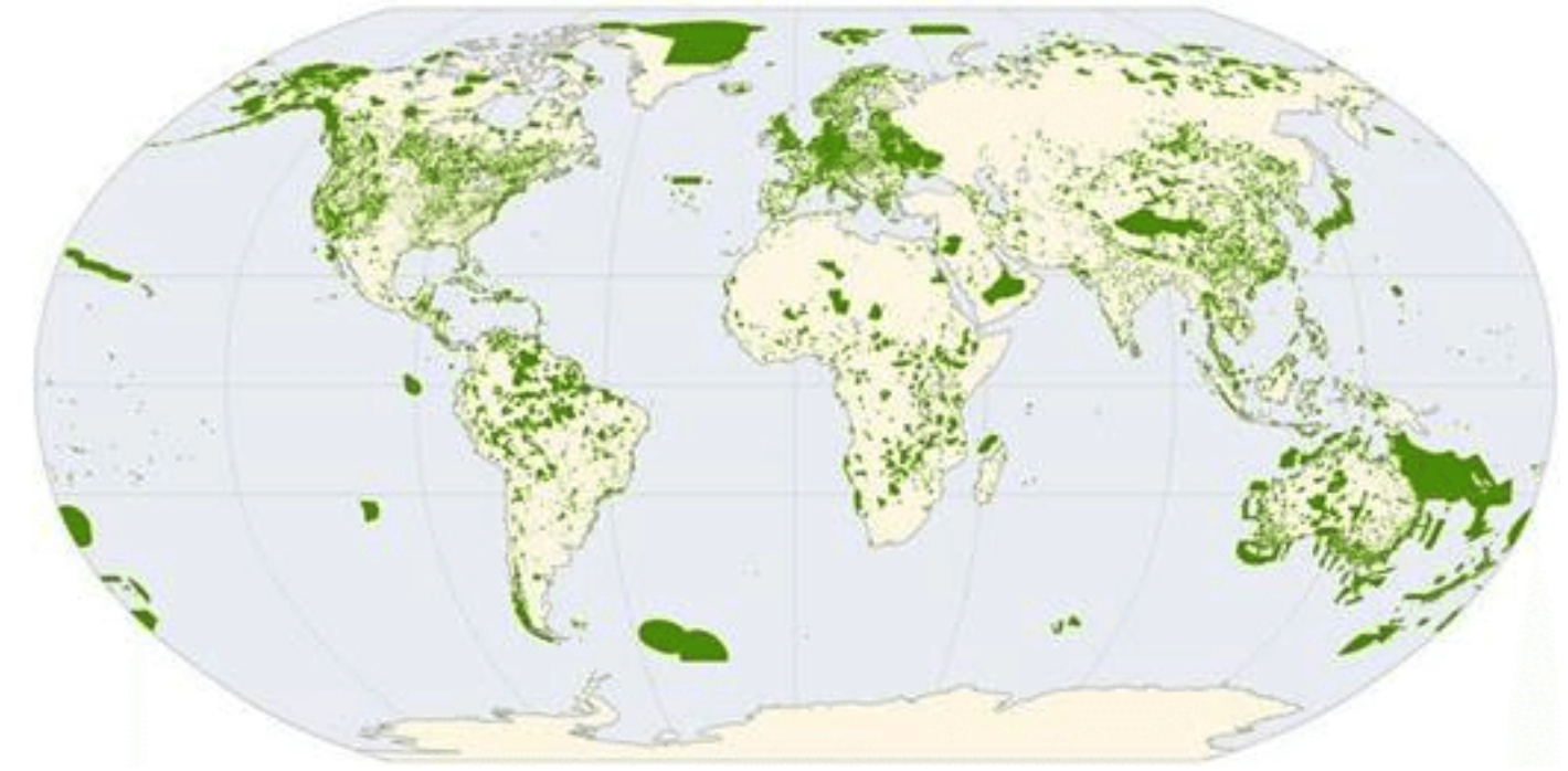
IUCN Map of Terrestrial Protected Areas (2017)

World Data Base on Protected Areas Areas (UNEP/IUCN/WCMC)